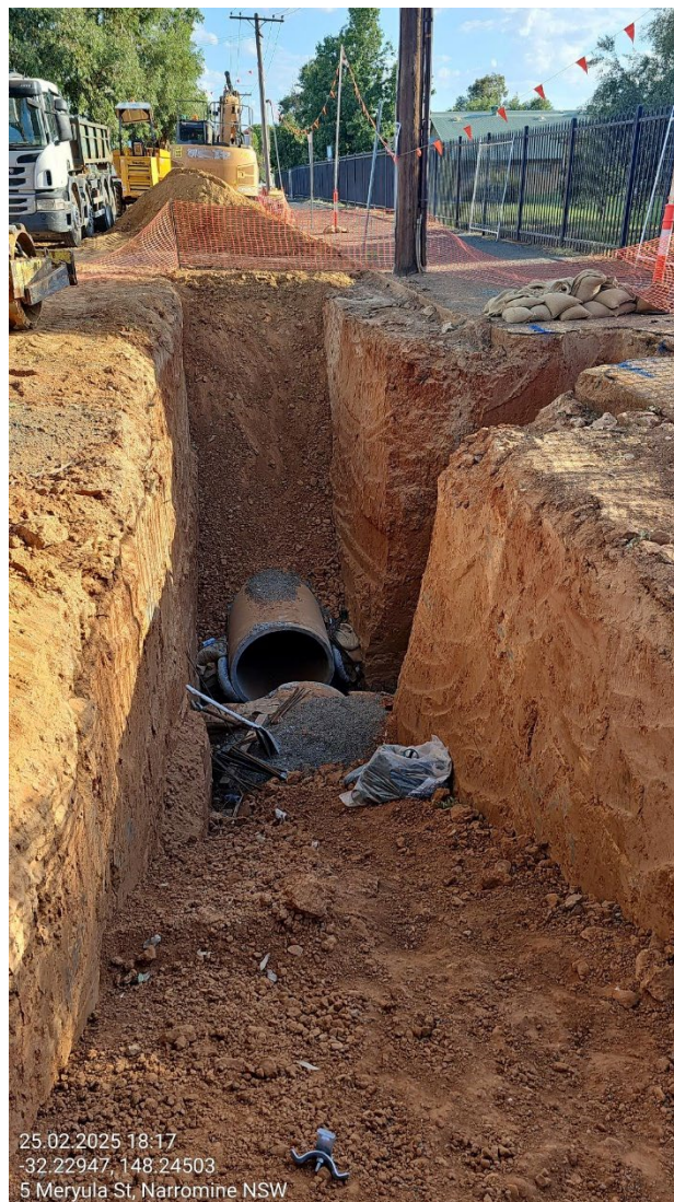
Figure 7: Installation of stormwater pipe along Meryula Street

As part of the next stage of works, the underbore beneath both Culling Street and Burraway Street is expected to take place in early April. Once completed, this major drainage upgrade will improve stormwater management and reduce future flooding risks in the area. The project remains on track, with full completion now scheduled for June.