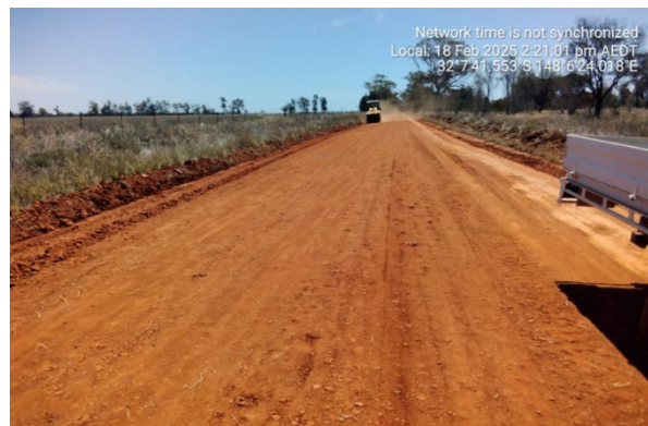
Figure 1: Recent grading and gravel resheet on Buddah Lake Road (left) and Ceres Siding Road (right)