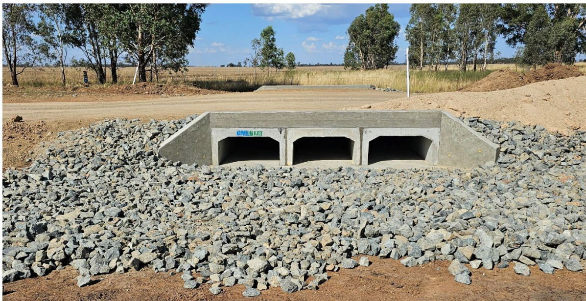
Figure 2: Significant drainage upgrades on Frecklington's Crossing have been completed

The drainage and road resheeting on Frecklington's Crossing are also complete, with the significant upgrade designed to ensure road trafficability even during heavy rain downpours.