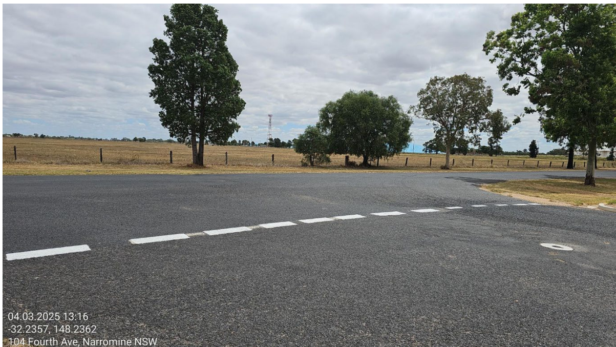
Figure 6: Line marking around Narromine is underway

Line marking on Tomingley Road was successfully completed in February. Currently, give-way line marking is underway across Narromine, with plans to finish the rest of Narromine and Trangie within the following month. Additionally, the line marking of car parking spaces in the central business districts of Trangie and Narromine is scheduled to occur in early April.