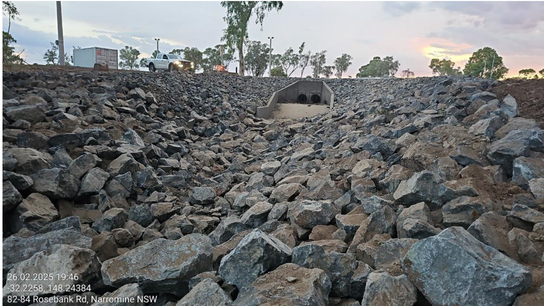
Figure 5: Remediated Stormwater Outlet at Rotary Park