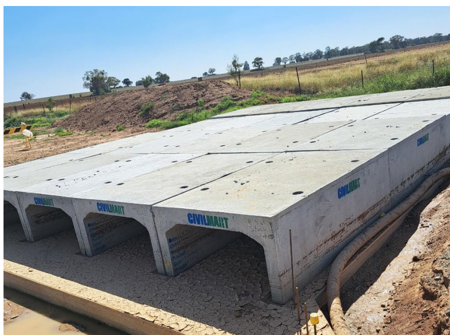
Figure 3: Drainage works are underway on Lincoln's Lane

Works are continuing on Lincoln's Lane where a new culvert is being installed. The large concrete structure will ensure adequate water flow during heavy rainfall events and will prevent the road from washing away. This improvement is funded under NSW Government "Betterment" funding. This key funding allows Council to upgrade and improve locations that were damaged multiple times during different flood events in previous years.