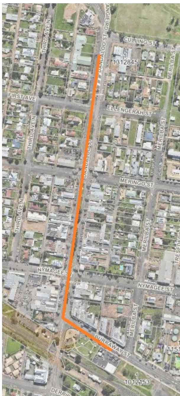
Figure 1: Proposed extent of 40 km/h zone